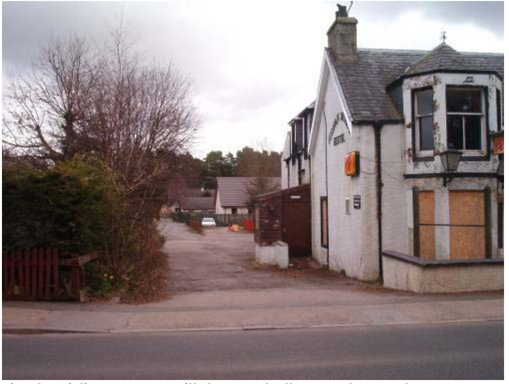
Fig. 4. Existing access with houses to the rear beyond