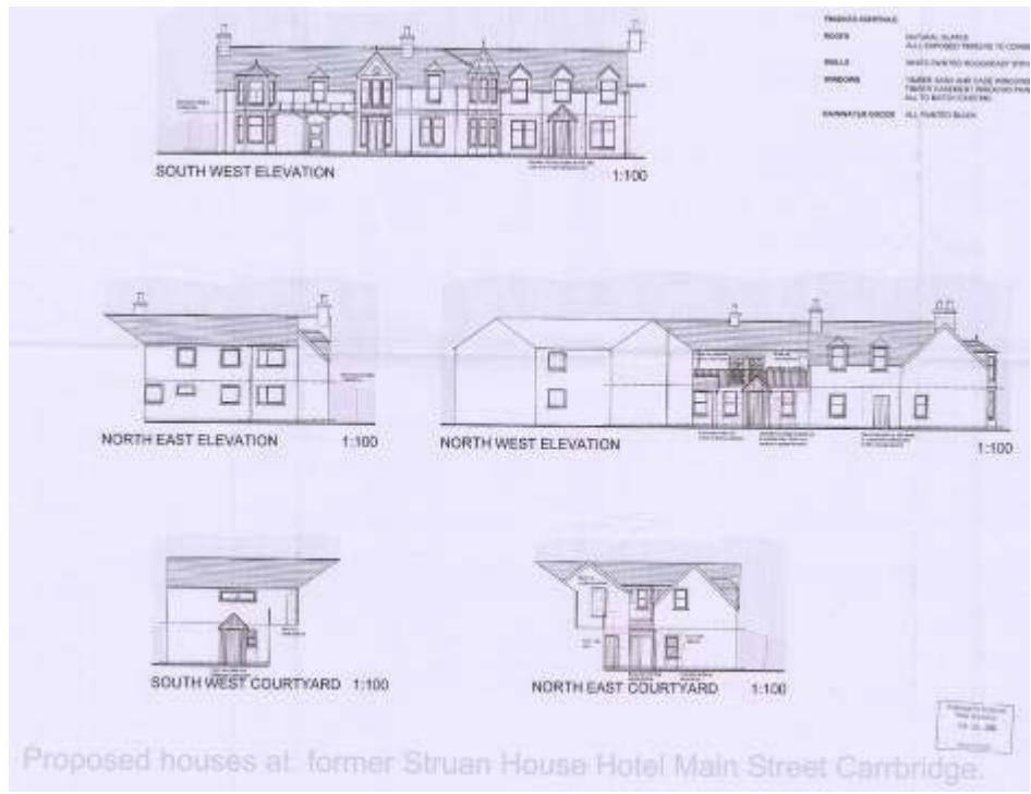
Fig. 6. Proposed Elevations