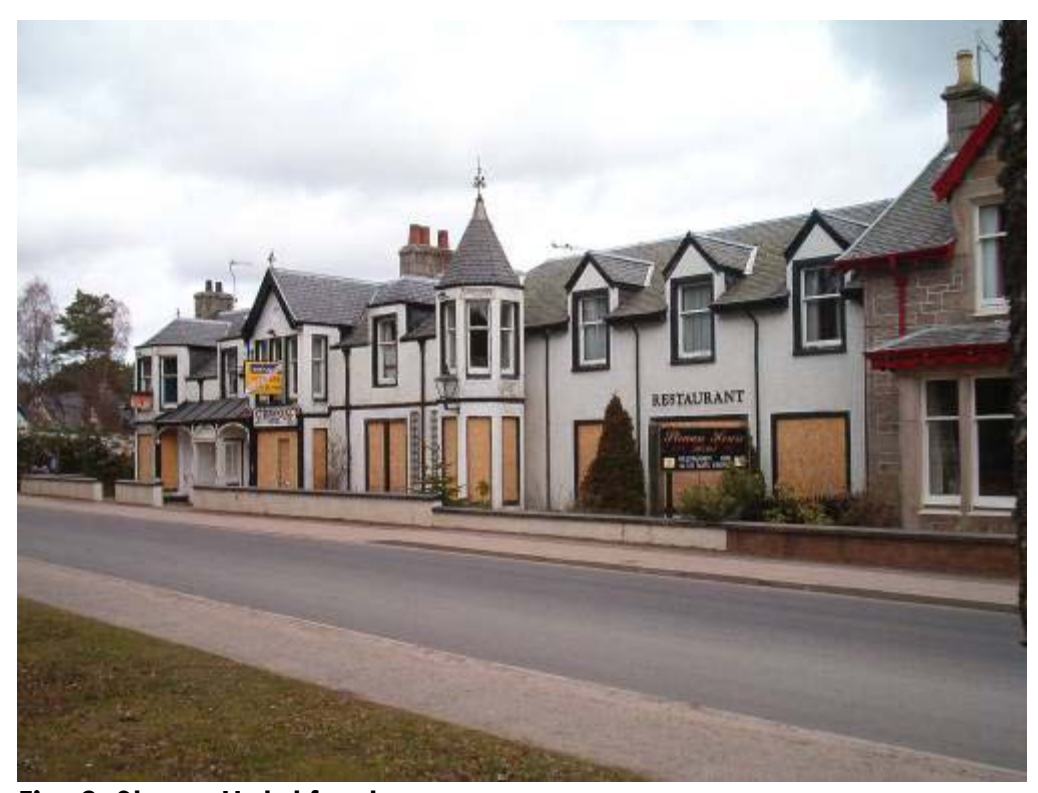
Fig. 2. Struan Hotel frontage

1. The "Struan House Hotel", which has been vacant from its use as a hotel for approximately 2 years, is located on Main Street in Carrbridge opposite "Landmark". The building consists of a traditional, 2 storey frontage, facing west to the public road, with modern extensions to the rear (east). The building is finished with slate to the roof, white washed wet harling to the walls, with traditional sash and case timber framed windows to the older part and modern casement window types to the rear extensions. A low wall forms the roadside boundary.