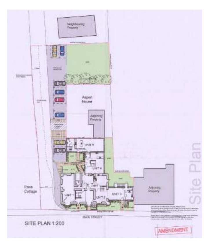
Fig.5. Amended Layout Plan

3. The proposal is to convert the former hotel into 5 residential units consisting of 4 no. 3 bedroom and 1 no. 2 bedroom units. The properties will be for the market. There will be 3 units formed in the original building and two units formed in the extensions. Externally, there will only be a few alterations, including the removal of some adjoining outbuildings and an external staircase, and the formation of some new porches, and doorway and window openings. The only change to the front elevation is the erection of a new porch and doorway to provide an entrance to one of the new residential units. The original proposal included the provision of 10 parking spaces aligned along the mutual access road and the erection of 5 double garages in an "L"- shaped building on the former parking area to the rear. Following discussions with the applicant's agent, this has been formally amended to remove the garaging, use the former parking area for a landscaped amenity area, thus retaining trees, rearrange the 10 parking spaces, create some footpath provision adjacent to the mutual access road and provide an additional landscaped entrance courtyard area to the 2 residential units in the extensions to the rear. Vehicular access to the parking courtyard of "Aspen House" is retained.