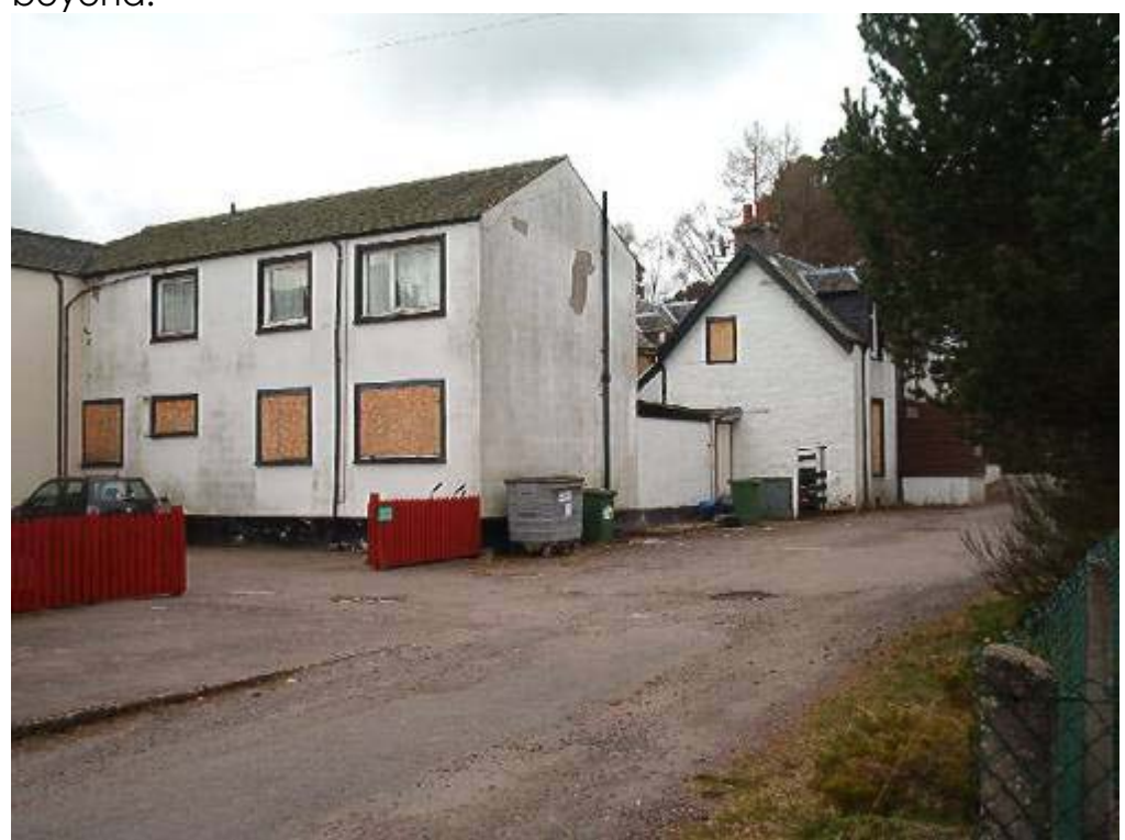
Fig. 3. Rear extensions to the hotel – part of the current conversion proposal

Vehicular access to the property is by an unadopted road, off Main Street, on the north side. This road also provides vehicular access to "Aspen House", "Carrwood" and two other properties beyond.